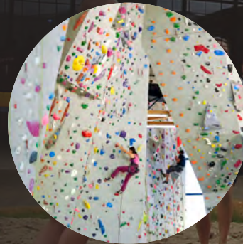
Climbing Wall & Boulder area