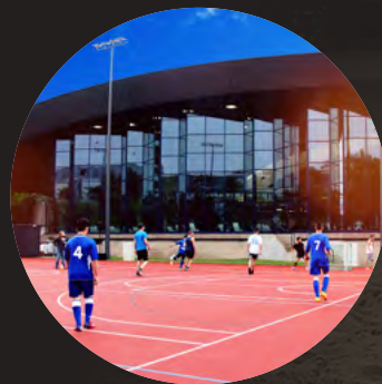
Outdoor Soccer Court & Beach Volleyball