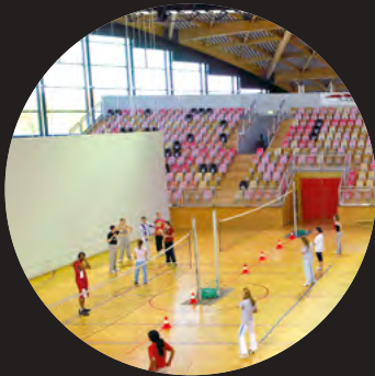
Indoor Sports activities Basketball / Volleyball / other